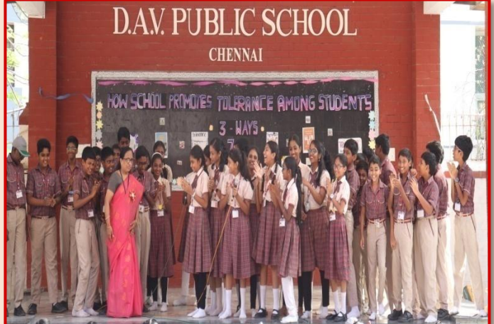
Honouring and Applauding for the Efforts put up by the Captain of the Ship