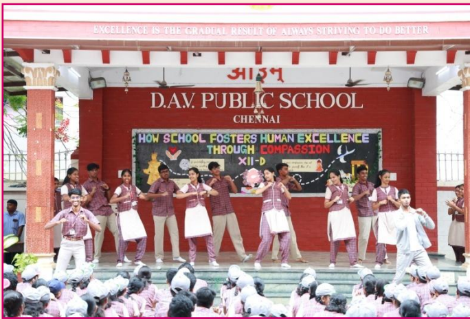
Dancing with their Hearts