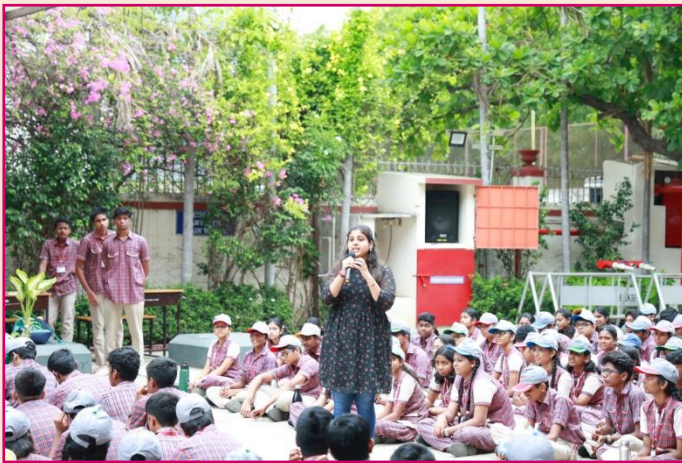
Words of Encouragement from an Alumna