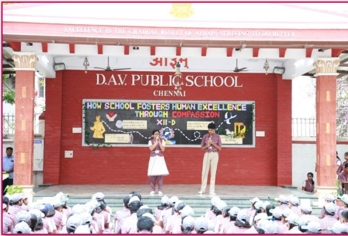
Glimpses of Compassion