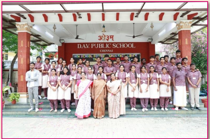
Class Photo of XII - D