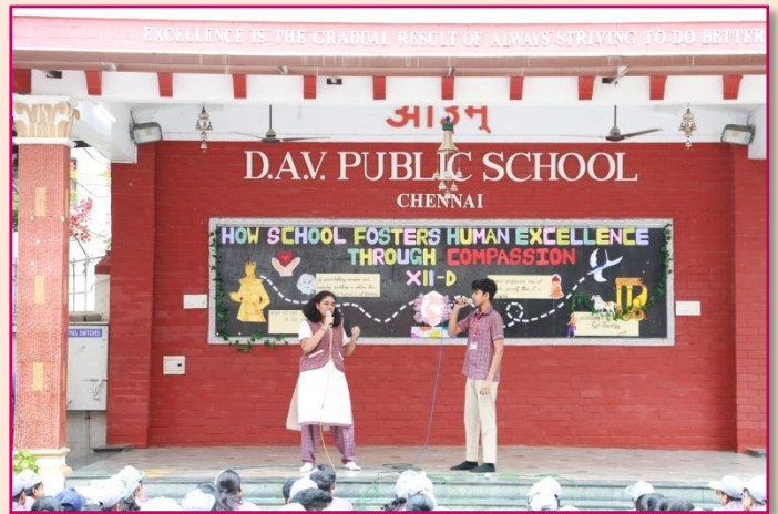
Expressing Compassion through Contemporary Form of Music