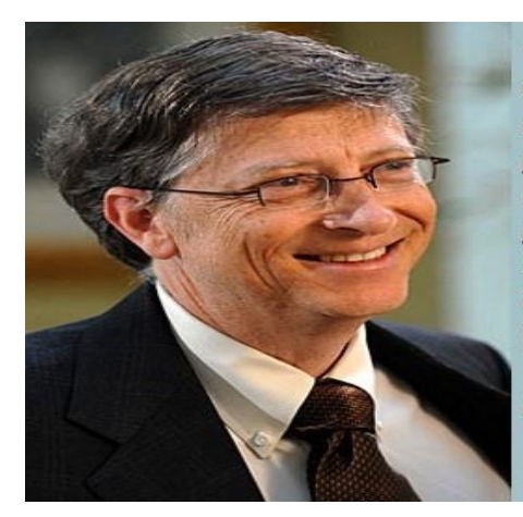
"Im a great believer that any tool that enhances communication has profound effects in terms of how people can learn from each other, and how they can achieve the kind of freedoms that they're interested in."