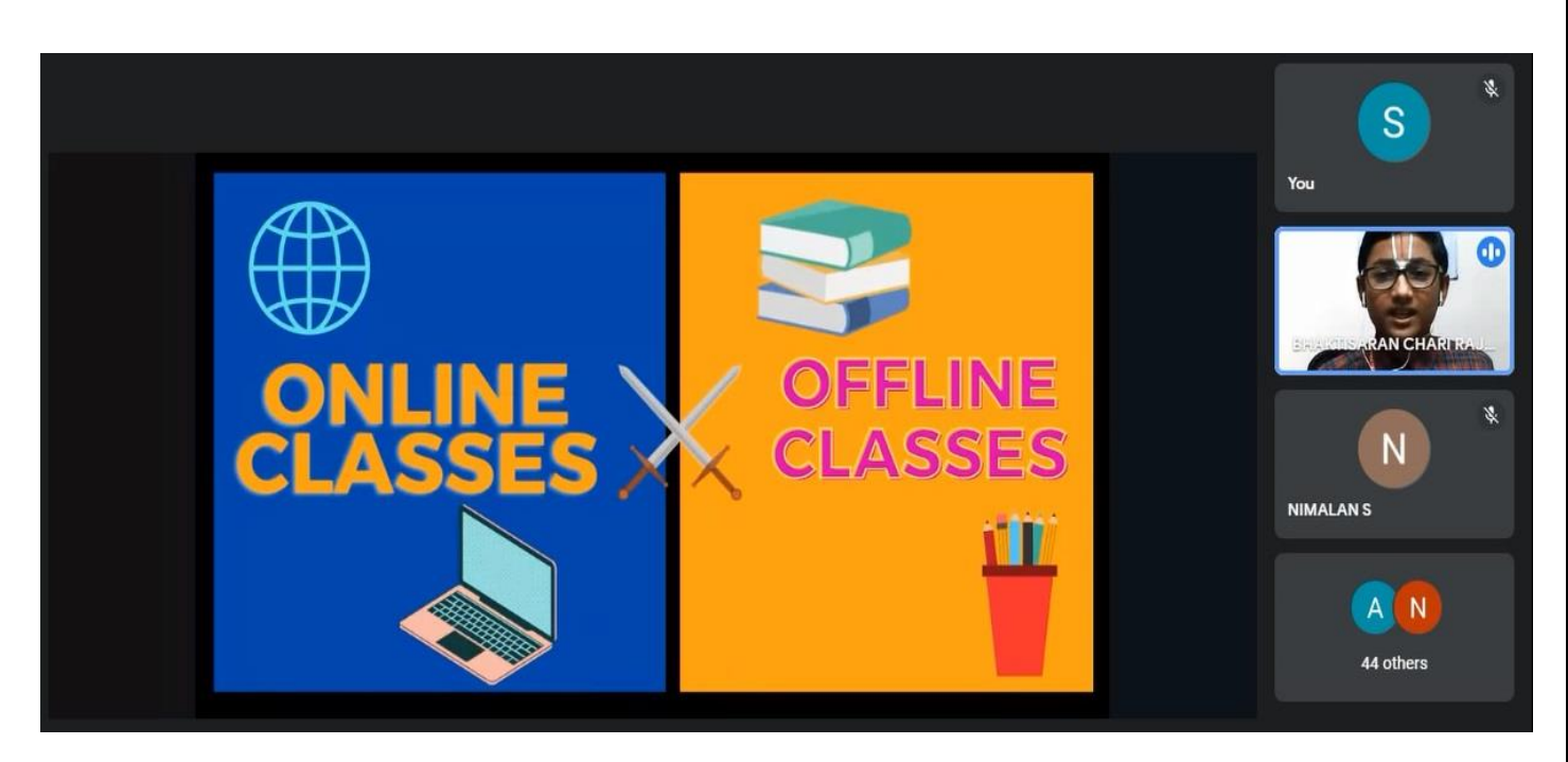
Rebuttal Rebels – Debate on Online Classes vs Offline Classes