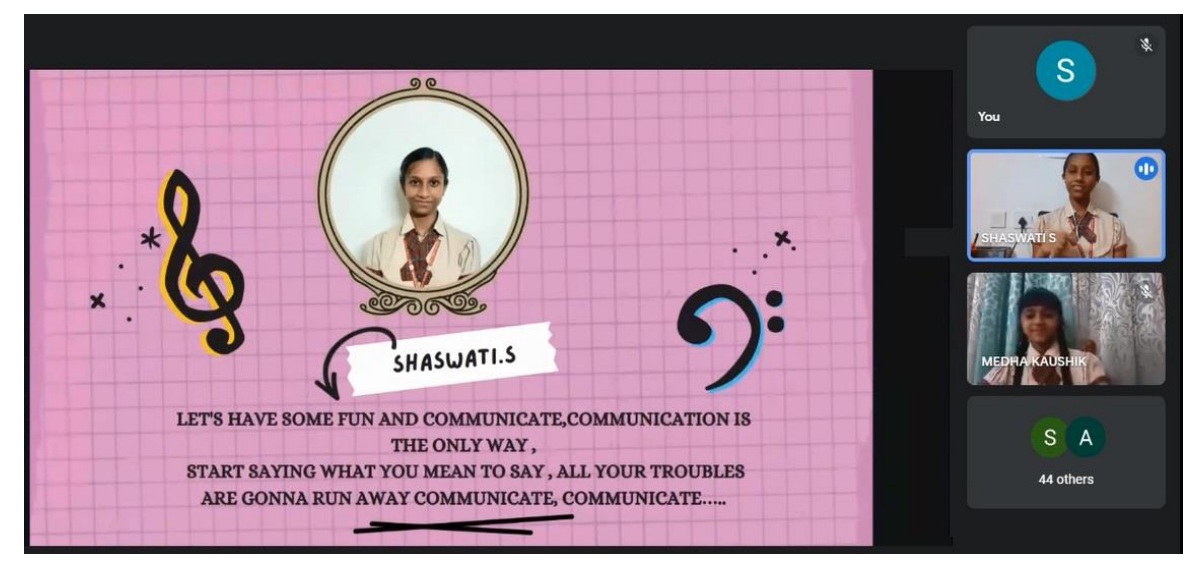
Melody - Song on 'Communication'