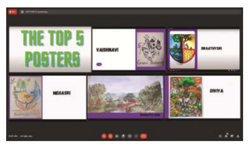
'Creative Fingers' a visual treat from the artistically abled