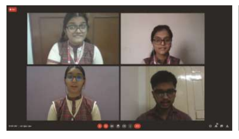
The anchors facilitate the proceedings