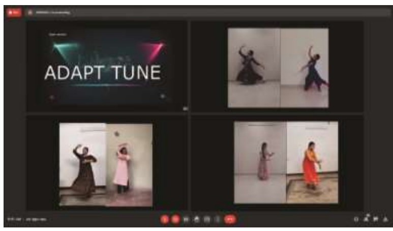
'Adapt Tune' a face off from the graceful dancing divas