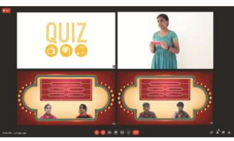
'Grey Matter' – a quiz for competence in current affairs