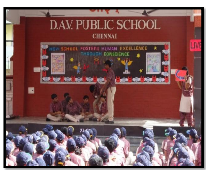
An Act on Spiritual Consciousness