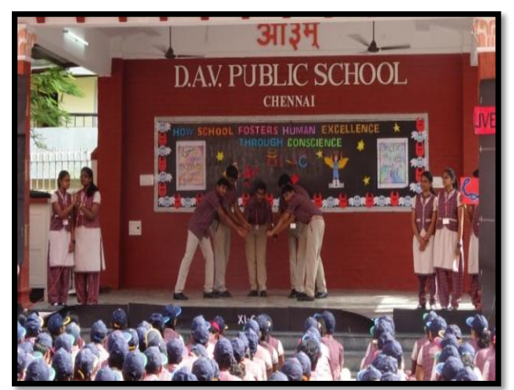
A Role Play to drive home the Importance of 'Swachch Bharat'

TOPIC: How School Fosters Human Excellence Through Conscience – 3 Ways