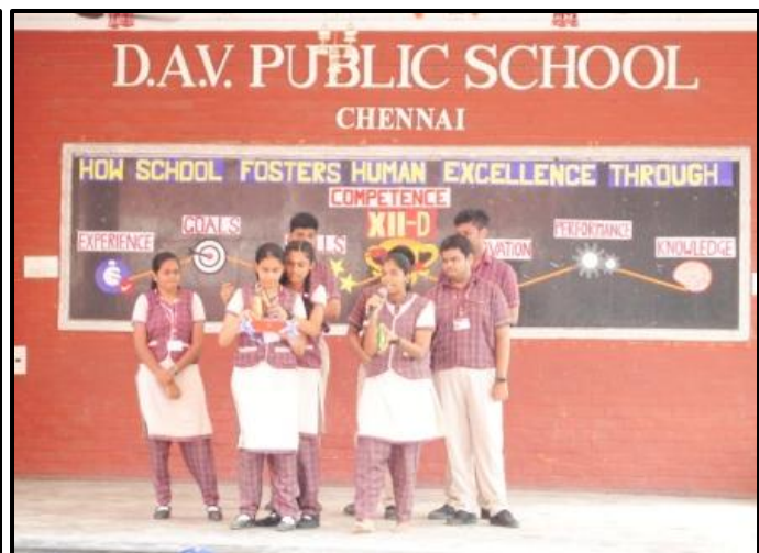
The Artists explain the concept of the Innovative Invitation Card