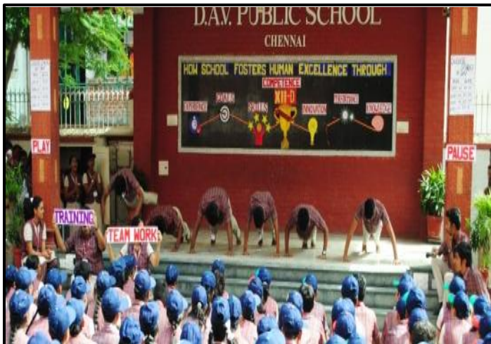
A scene from the Skit- "Mind Voice"