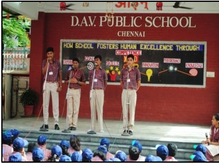
Recitation of Tamil and Sanskrit shlokas