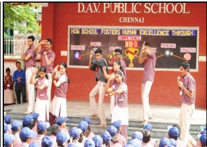
Kinaesthetic Intelligence - A 'Rocking Performance'