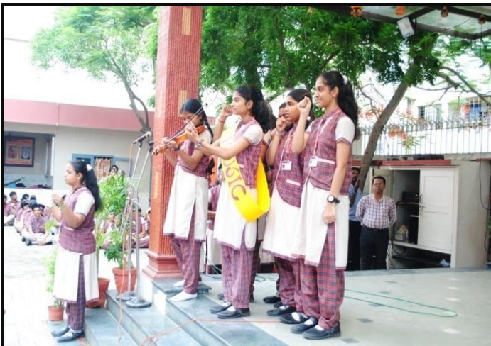
An Animated Scene of the Medley of Opportunities given by the School to gain Competence