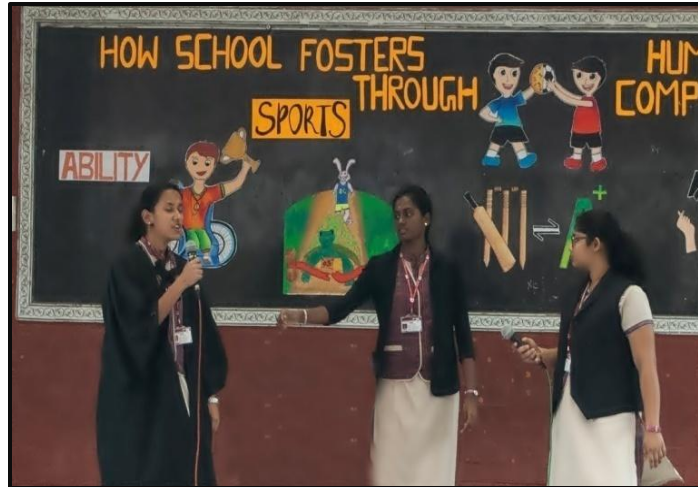
Students enact a Court Room Scene to portray Competence in Life