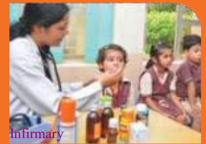
Infirmary "Health Comes First"

Mathematics lab is the best place where children can find a collection of games, puzzles, magic squares, geometric tools and other teaching and learning material that makes mathematics interesting to learn. The activities performed here help students to visualize, manipulate and reason. Students are provided with opportunity to make conjecture and test them, and to generalize observed patterns.