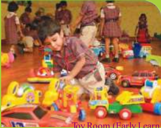
Toy Room (Early Learning Room)

“Being there for a child is the most noble thing a toy can do”