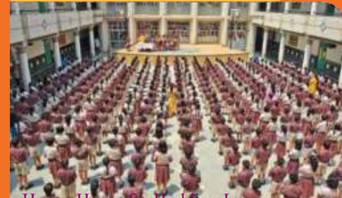
Happy Hours for Budding Learners

“Look at the sky. We are not alone The whole Universe is friendly to us & conspires only to give the best to those who dream and work.”