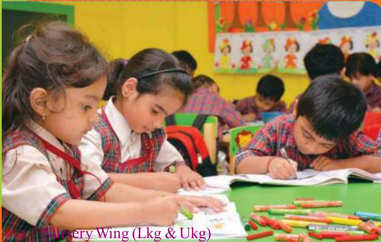
Nursery Wing (Lkg & Ukg)