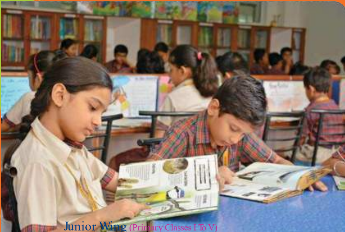
Junior Wing (Primary Classes I To V)

The primary school programme encourages inquiry and exploring, and develops children's competence in various skills – reading, writing, listening, speaking, problem-solving, observation, measurement and communication technology. Each day is a new beginning and as each day unfolds, it brings with it a wave of freshness. A novice zeal and zest to learn, to explore is catered with utmost and upgraded infrastructure, endeavours and intellectualism of learned faculty.