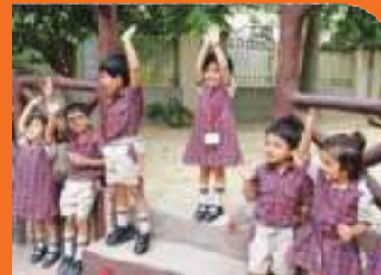
Music & Dance Room

Medical supervision and assistance is provided to students under the care of professional doctors and nurses. The School clinic is equipped with all the basic medicines and equipments. All cases of injury and illness receive immediate medical attention. Regular medical camps are organised in the school campus. Hence, health is priority to us, we keep close watch on the student's mental and physical well being.