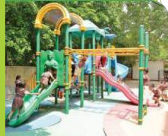
Play Area For Tiny Tots

The play area for our tiny tots is perhaps one of the most colourful areas of the campus. Equipped with swings & slides it is an area demarcated for the young learners of nursery wing. Under the supervision of teachers and lady guards it is an ideal place for students to have fun in the sun. Multi Action Play system, Merry Go Round, rock horses, sea-saws and toy cars are placed to recreate, refresh and have fun and frolic.