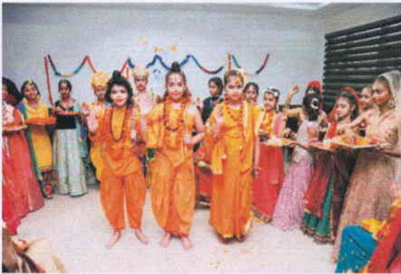
Class VII-VI enacted the scene of Lord Rama's return to Ayodhya and the celebrations consequent to his return on 25th October 2019