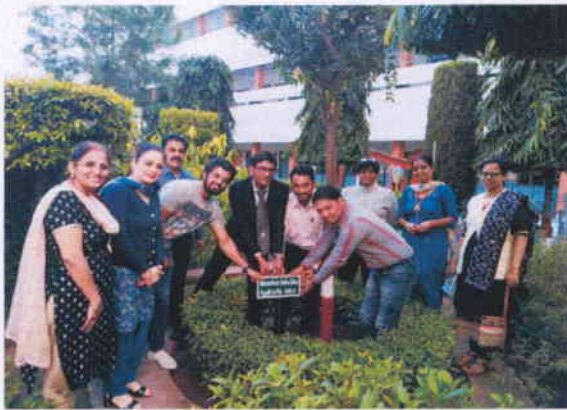
KBDAV-7 Alumni Cricket Team marks the beginning of a new association- Place Tags in the Herbal Garden on 9th November 2019, as they gear up to face Teams from Tri-City in the DAV United Cricket League Matches on 26th January 2020