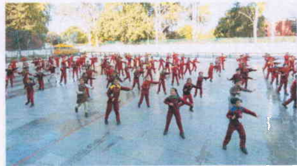
Students practise the steps of Zumba during the Fit India Week celebrations as per CBSE Guidelines