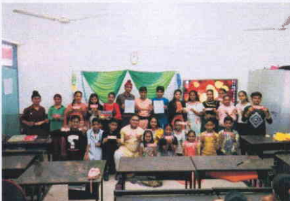
Elocution is important! Class VII makes learning playful as they perform a role-play on 9th November 2019 on Friendship