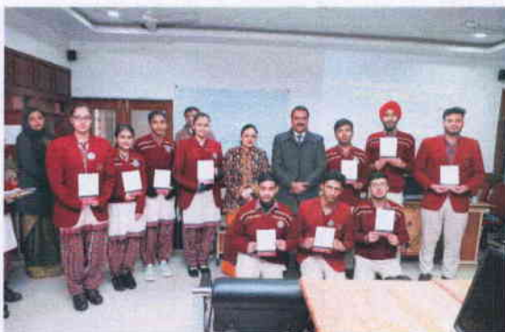
The Nukkad Natak Team of " Jo Fit Hai, Vo Hit Hai" received Recognition Certificates