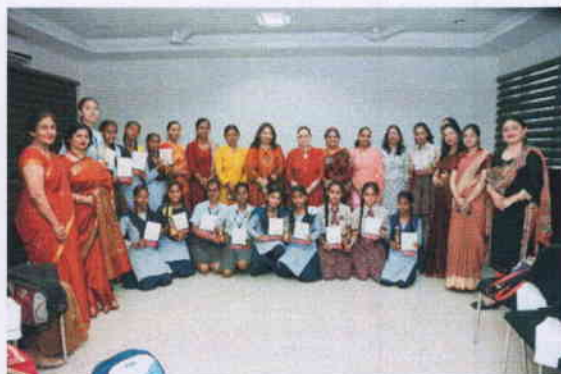
Winners of Poster Making Competition