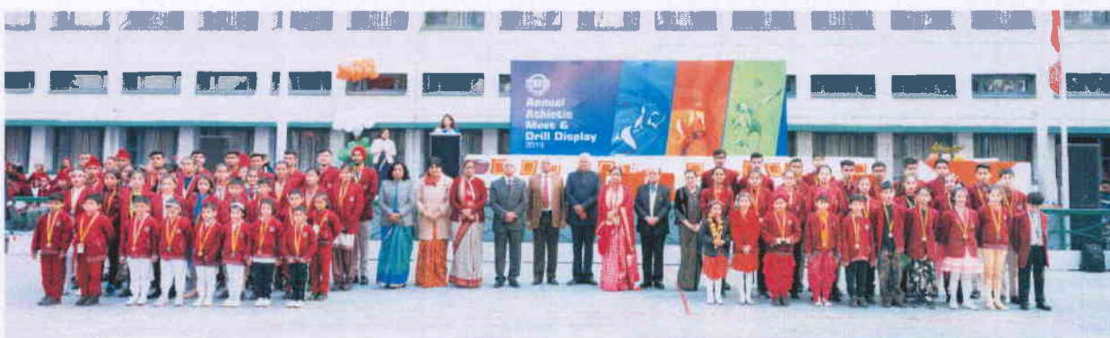
Annual Athletic Meet 2019