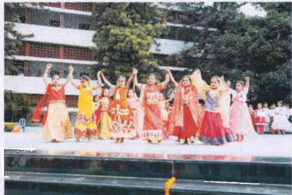
Class II of Junior School joyously express their gaiety on 25th October 2019 as the School celebrated Diwali