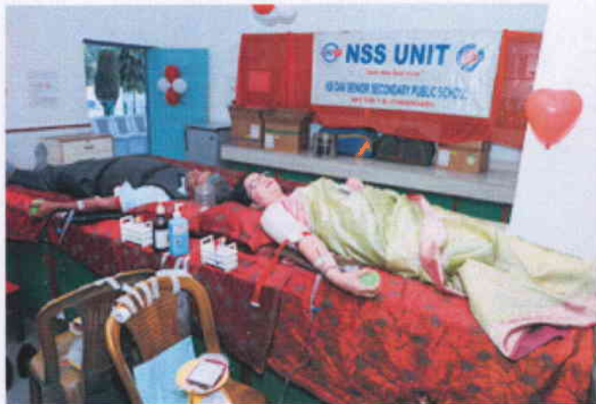
The Blood Donation Camp held in the School on 7th December 2019 recorded a collection of 99 Units of Blood. Parents of the School, along with the Teachers and Staff came forward to make the Camp successful. More than 167 people registered in the Camp, which is an Annual endeavour, held in collaboration with PGI Blood Bank Society and HDFC Bank The Community also joined the School in the endeavour. The NSS Volunteers along with the School's Red Ribbon Club organise the Event