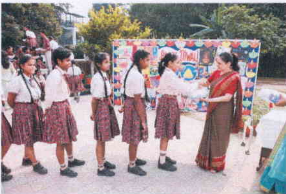
The Champions of Life-Saral Ahsaas celebrates Diwali with their extended Family on Campus on 25th October 2019