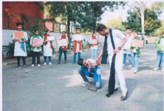
Nukkad Natak by Class X