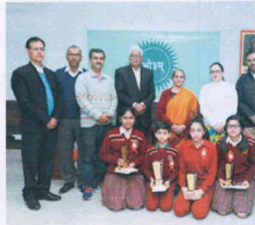
Shrimad Bhagwad Gita Inter DAV Shalok Recitation Competition was organized on 30th November 2019 in collaboration with Gita Prachar Samiti, Panchkula. 220 students from DAV Institutions of Tri-city, Derabassi and Surajpur participated in Shalok Recitation Junior and Senior categories and Poster-making on the theme "Gita Ka Updesh"