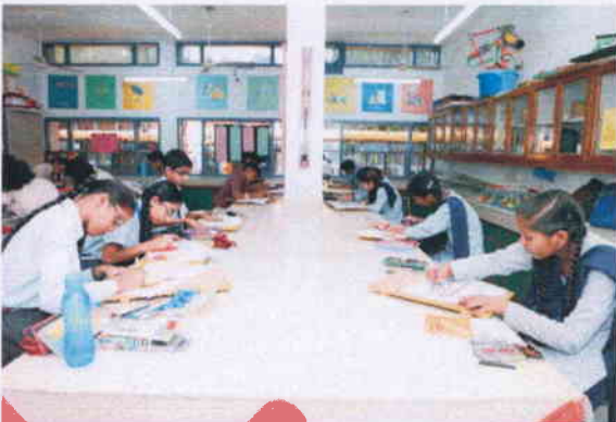
KBDAV-7 as Lead Collaborator of HUB OF LEARNING, on 24th October 2019, conducted a spate of activities