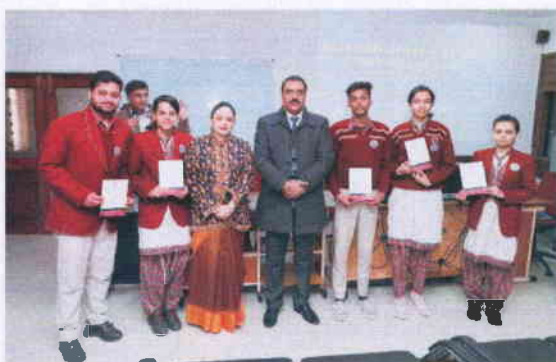
The Bhangra Team put up a wonderful Dance Performance at the Alumni Meet 2019 on 29th December 2019