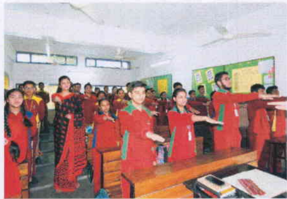
During Vigilance Awareness Week, KB DAV -7, Chandigarh takes an Integrity Pledge against corruption. Students took the pledge to create awareness against corruption and learnt about the Code of Ethics. A role-play "Jaag Utha Insaan" was presented by the students of Class X