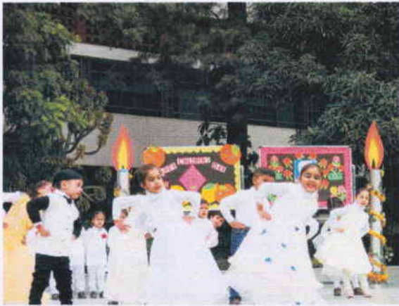
Class Nursery put up a special Assembly to celebrate Children's Day on 14th November 2019